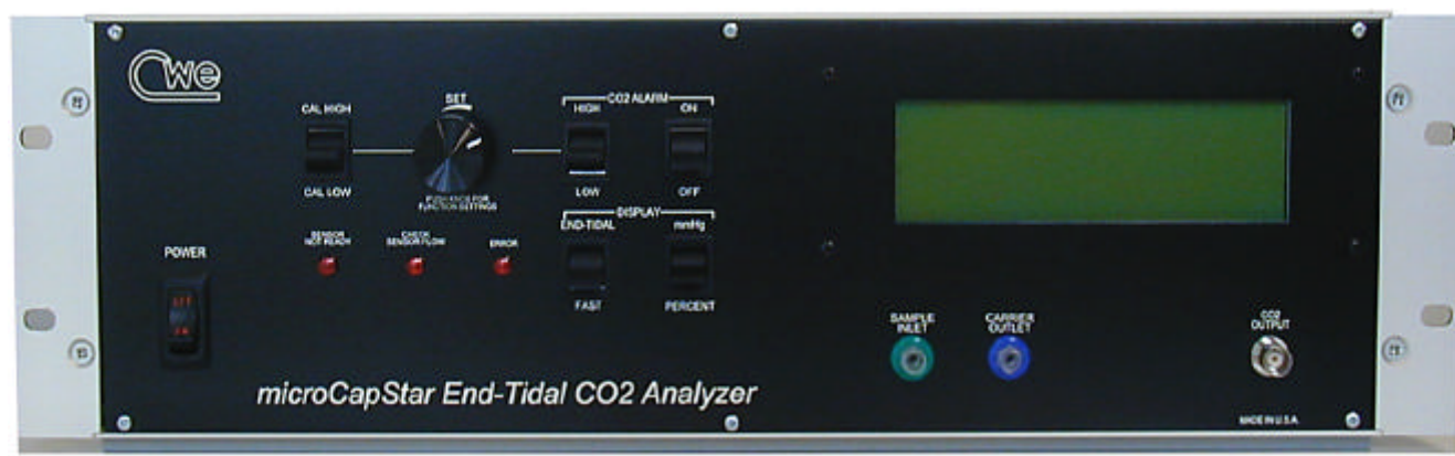
MicroCapStar Front Panel

The MicroCapStar has built-in audible and visual alarms for detecting out-of-range end-tidal CO 2 and other alarm conditions. The CO 2 alarm range and the calibration settings are stored in non-volatile memory and automatically reinstated when the instrument is next used.