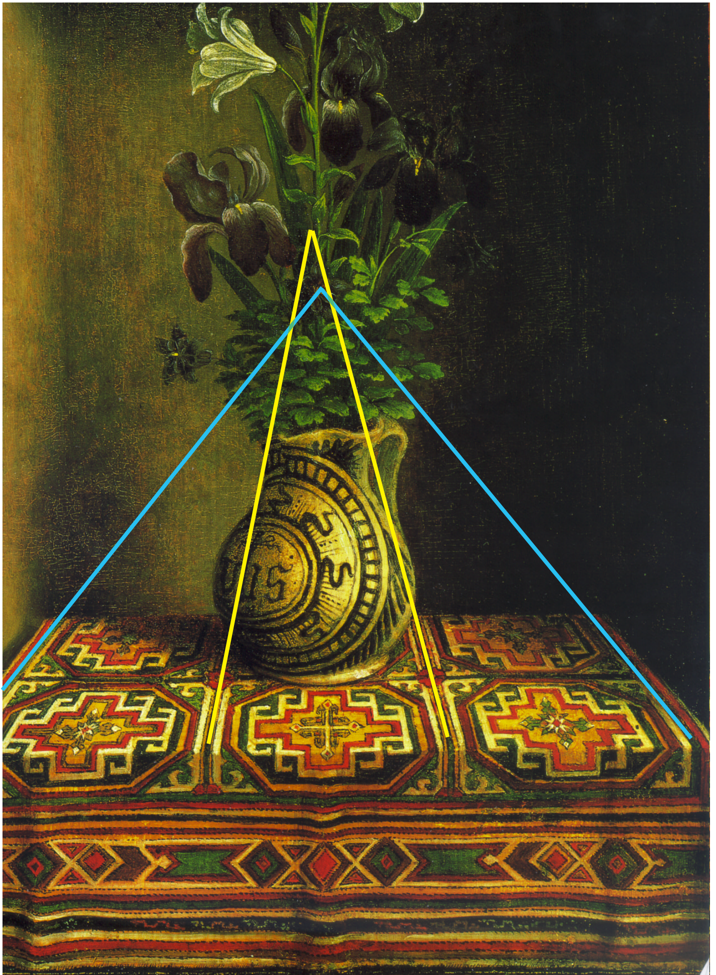
Hans Memling, 1485AD, Marian Flowerpiece