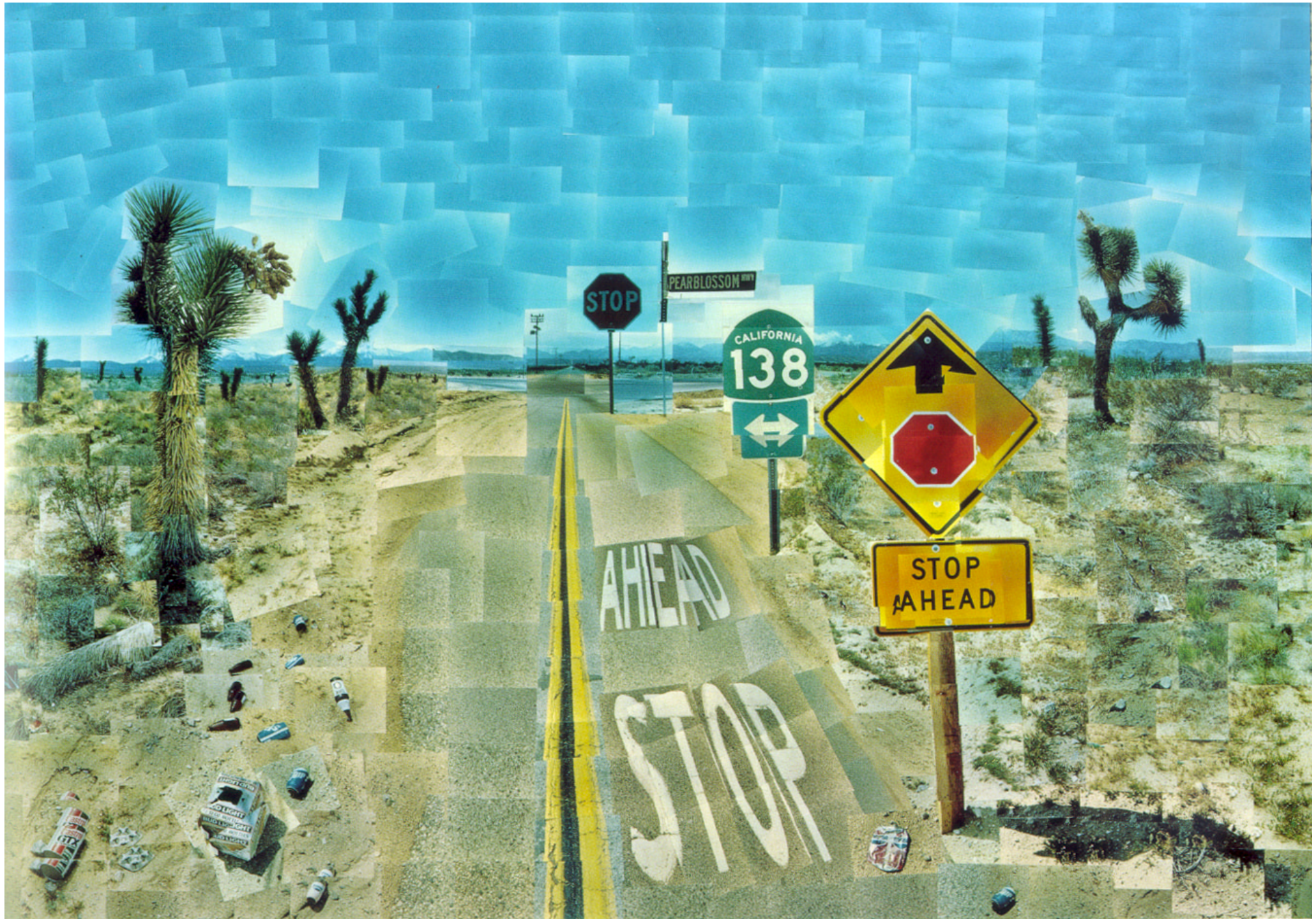
David Hockney, 1986AD, Pearblossm Highway