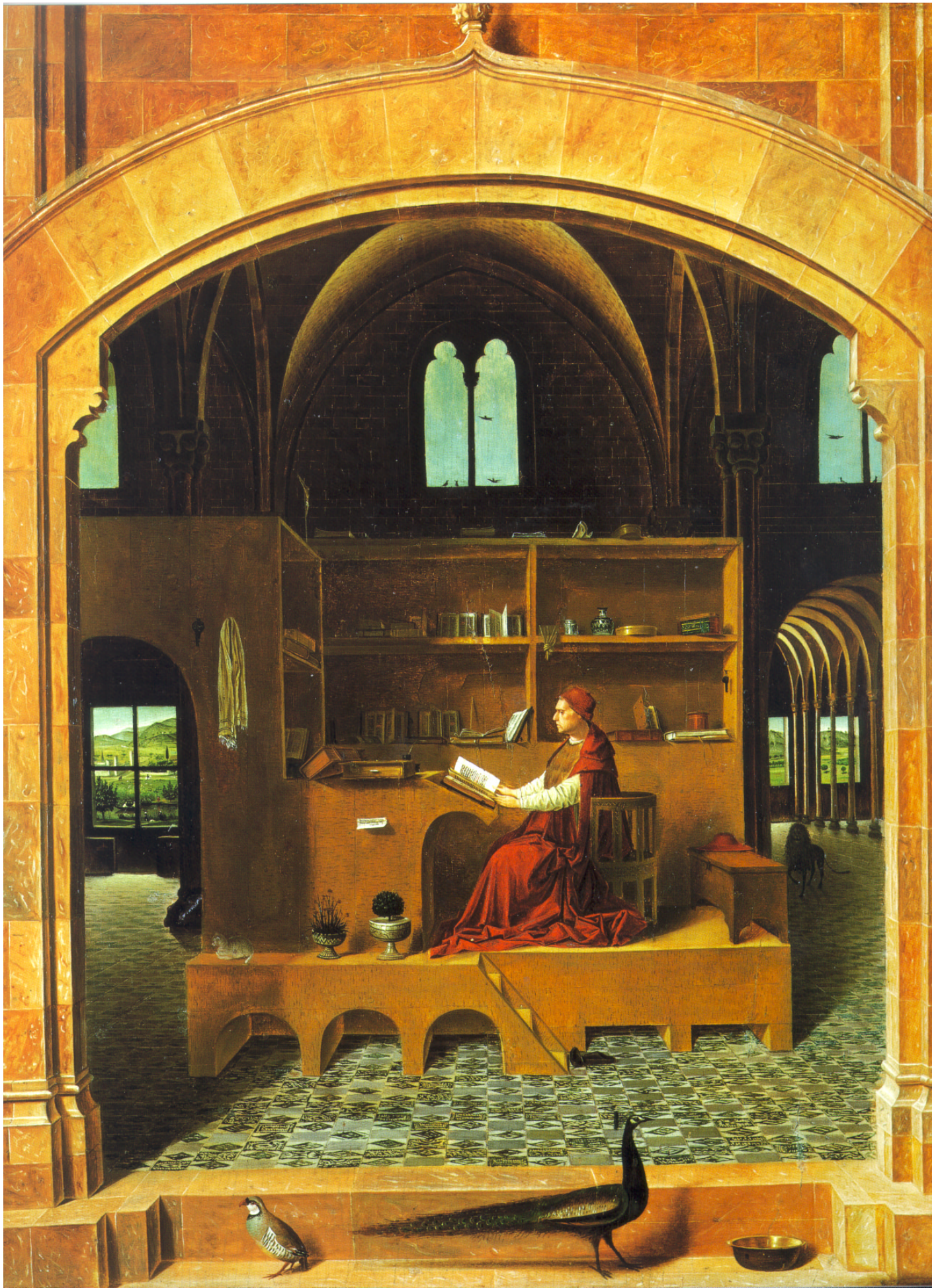
Antonello da Messina, 1465AD, St. Jerome in His Study