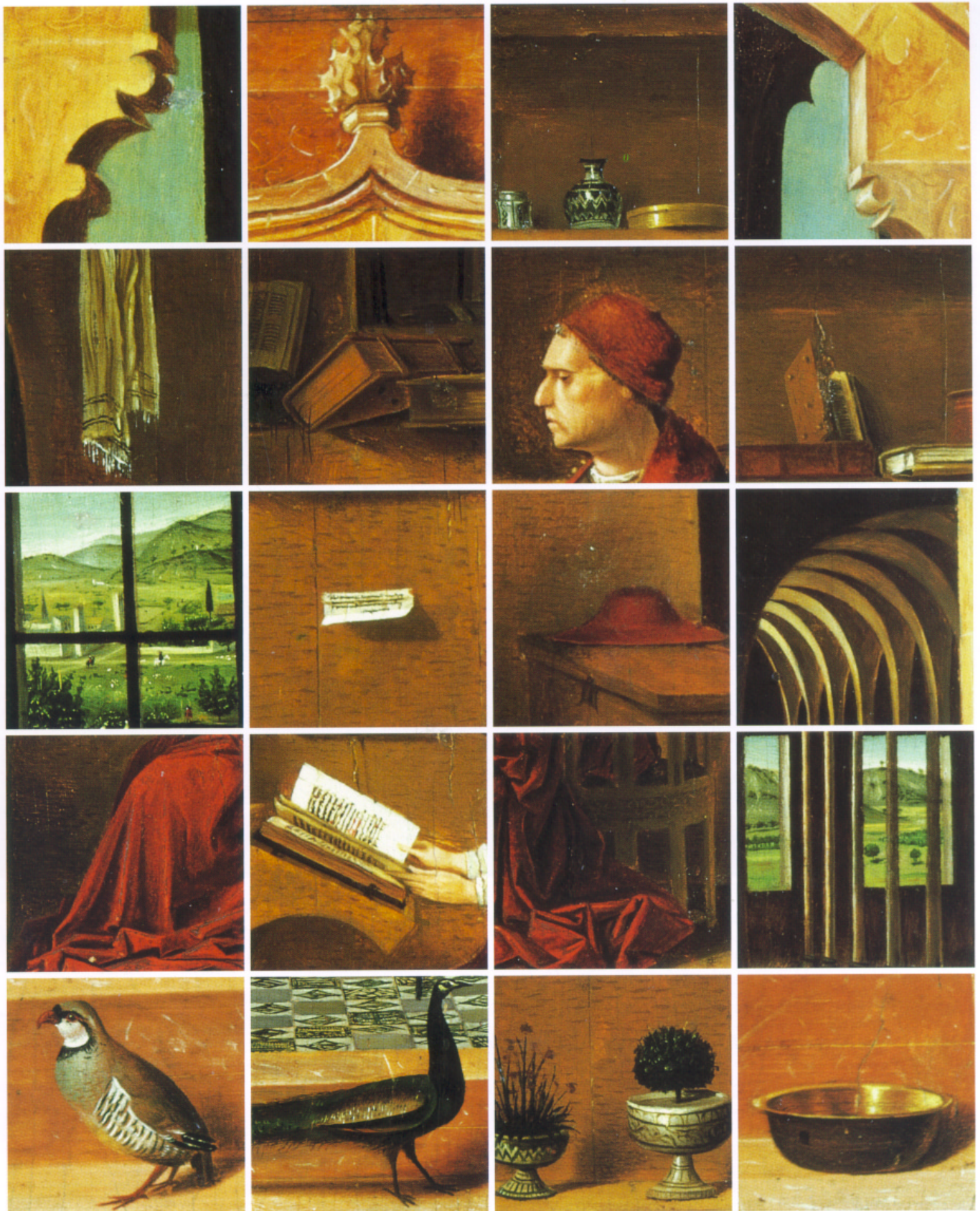
Antonello da Messina, 1465AD, details, St. Jerome in His Study