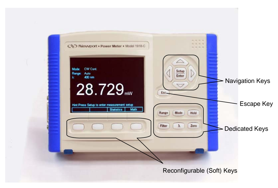
Figure 2 Front Panel keys