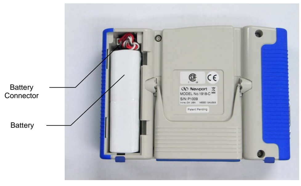
Figure 1 Rear panel with the battery cover removed

To install the battery, first remove the battery compartment cover from the back of the unit. Connect the 5-pin battery connector to the corresponding connector inside the battery compartment (Figure 1). The connector is keyed and can only be inserted in one direction so please be careful to properly align the connector pins. Carefully fold the battery wires inside the battery compartment so that the wires will not put pressure on the battery compartment cover. Close the cover and make sure it latches in place.