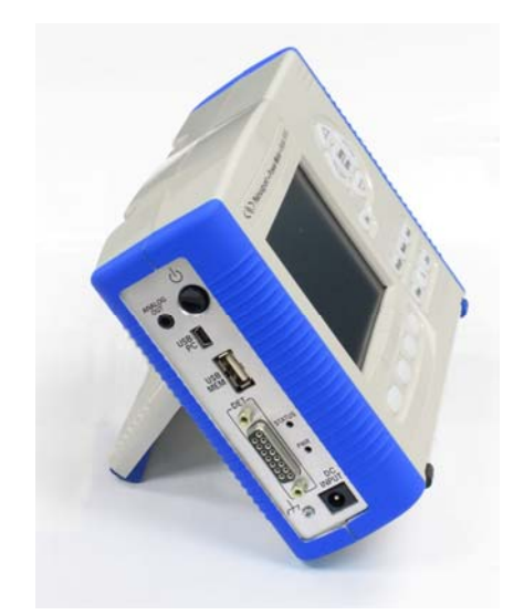
Figure 6 Kickstand in the first angled position