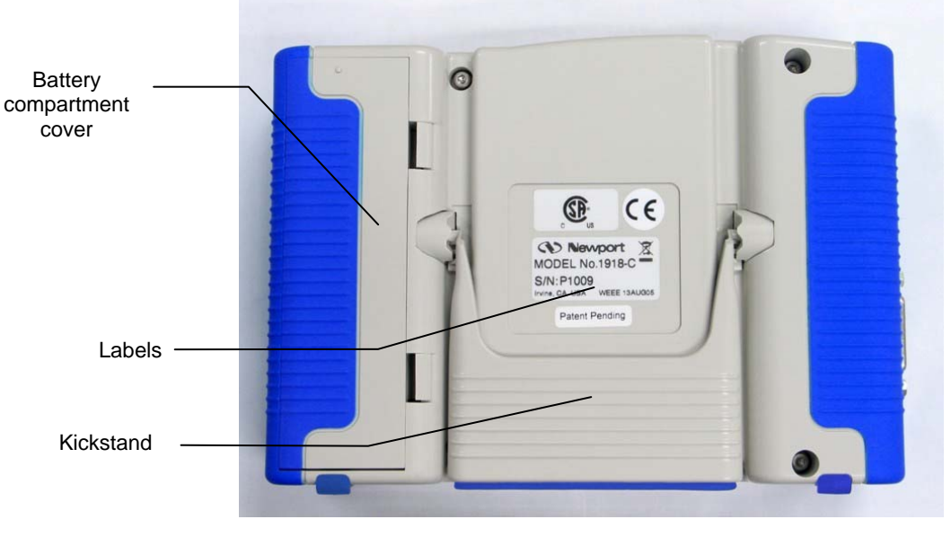
Figure 5 Rear panel