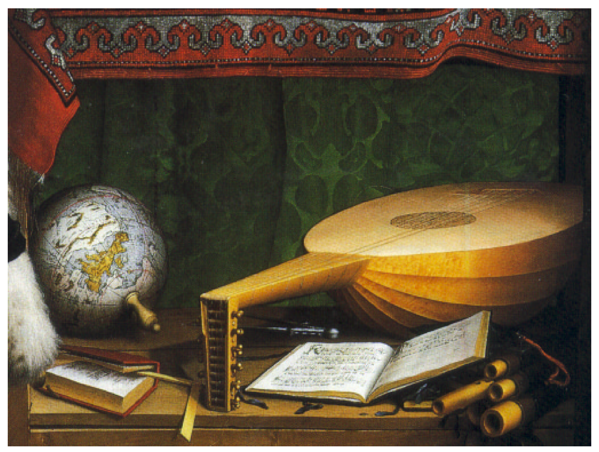
Hans Holbein the Younger, 1533AD, Detail of work bench, The Ambassadors