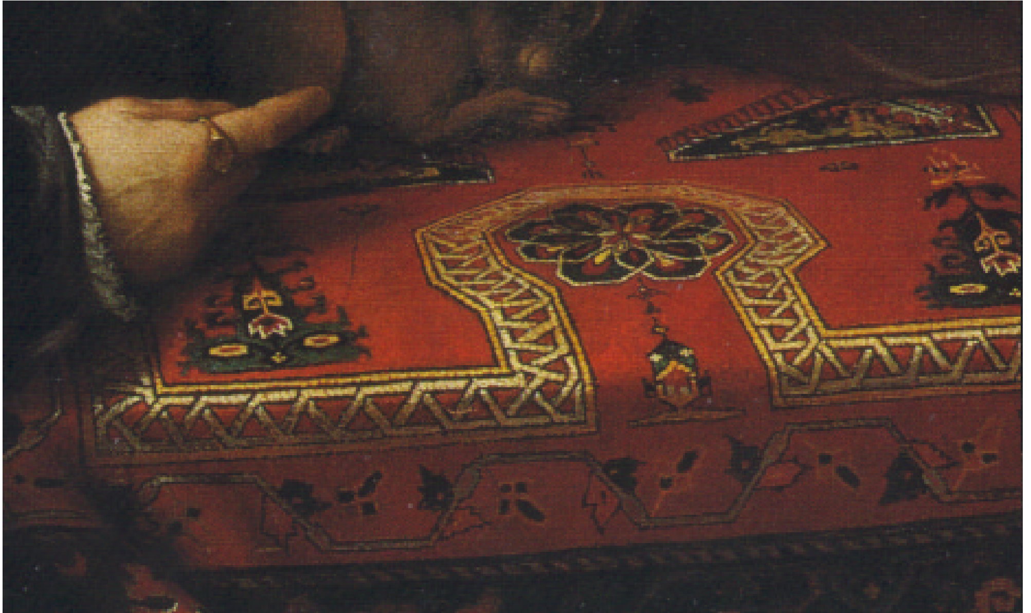
Lorenzo Lotto, 1543AD, detail, Portrait of Husband and Wife