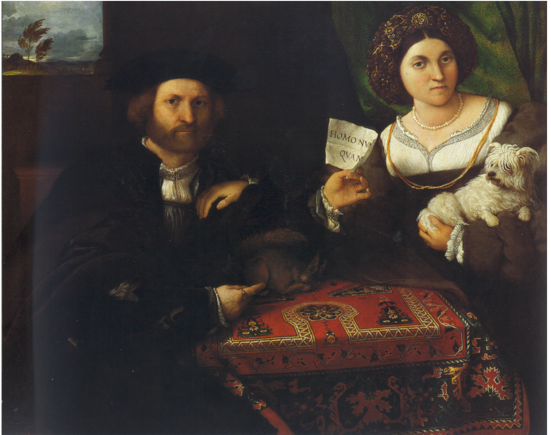
Lorenzo Lotto, 1543AD, Portrait of Husband and Wife